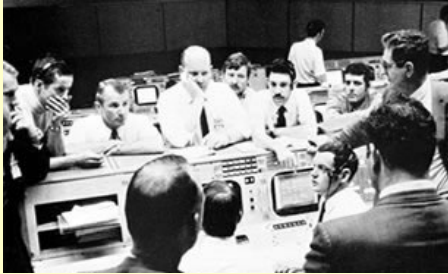
Houston Mission Control - The team interprets telematics data to find a way to get Apollo 13 back to earth

Solar generation systems with complex equipment requires comprehensive monitoring to operate properly, just like a spacecraft does. With SolarVu SMART Enterprise™ at mission control - aka Your Office - determine if all systems are go and pinpoint problems as they occur. Use SurePoint™ Analyzer tools running 24/7 diagnostics to dispatch O&M staff with the right spares in the truck to fix problems. Generate custom financial reports for investors from the lifetime data stored in the SolarVu database. Ensure your solar assets are producing at 100% all the time to maximize the ROI on a portfolio.